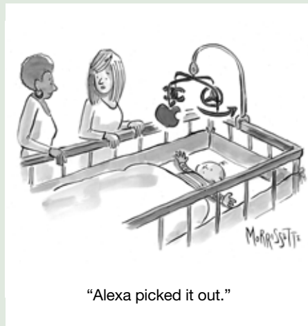
“Alexa picked it out.”